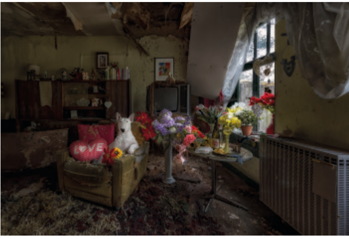
Title: Furbex - Love Bite The 2019 ASISAFoto special prize for the best artist