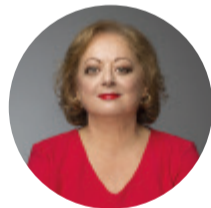
Cristina García Rodero

1993 - First Prize Word Press Photo in the Art category. 1996 - National Photography Award from the Ministry of Culture in Madrid. 2005 - Gold Medal for Merit in Fine Arts. 2005 - Joined the Magnum photojournalism agency. 2018 - First woman doctor honoris causa by the University of Castilla-La Mancha